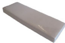
100 pre-cut Strips (7.5cmx23cm) 90g

These top quality waxing strips are woven together in such a way that it won't tear when performing a wax removal.