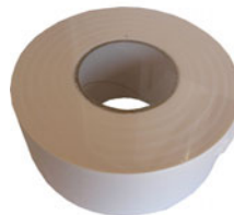
100m Roll (7.5cm wide) 90g